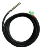
TS-R Remote Temperature Sensor